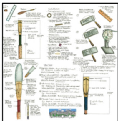
11 X 11 Laminated Oboe Reed Making Chart - $20

We choose only the best pieces and reject around 2/3rds of the cane we process. We set our gouging machines to .59-.60 mm in the center and .47-.48 mm on the sides. We also only gouge and sell 10-10.5 mm diameter cane unless we have a special request for a different size. The measurements of the gouge and straightness of the pieces are the most important elements to making an up-to-pitch sealed reed.