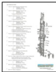
Oboe Playing & Adjustment Checks Chart - $15

This is an easy to understand guide to basic oboe repairs.